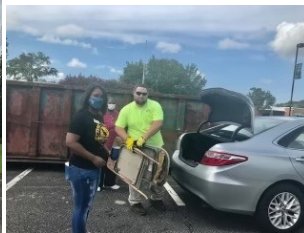
Dumpster Day at Rippon Middle School