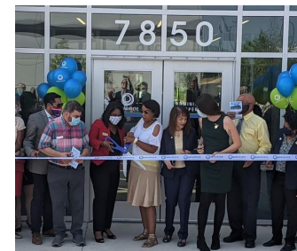
The ribbon cutting for the western maintenance facility