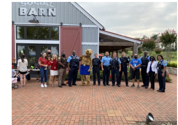
National Night Out— August 3, 2021 A National community-building campaign that promotes police-community partnership