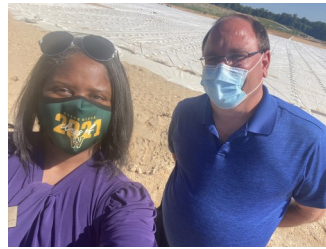
Visit to the PWC Landfill