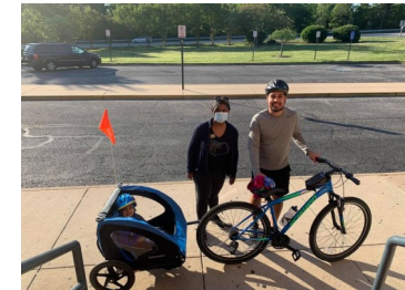
The Washington, DC Regions 20th Anniversary Bike to Work Day.