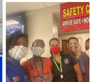
Visiting with employees at PRTC