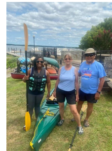
Thank you to the Belmont Bay Marina for taking me out kayaking to learn more about the Occoquan River and to discuss ways we can all work together on make Woodbridge a marina destination.