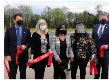
Ribbon cutting for the Route 1 widening project within the Woodbridge District.