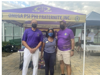
Rippon Middle Back to School rally