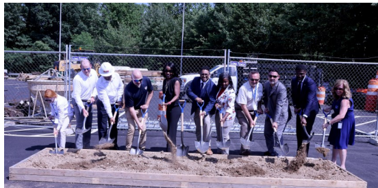
Groundbreaking on the Summit School Road and Telegraph Road Widening Project (Ocoquan District).