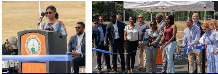
Ribbon Cutting Ceremony Neabsco Mills Road Widening Project.