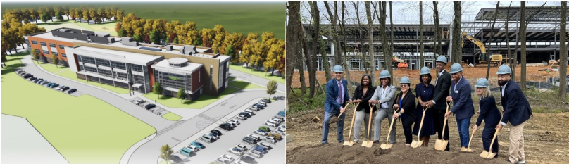
Groundbreaking Ceremony for Woodbridge Area Elementary School, Woodbridge, VA.