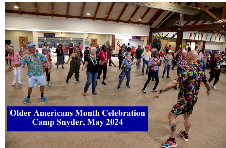
Older Americans Month Celebration Camp Snyder, May 2024

https://www.fairfaxcounty.gov/neighborhood-community-services/virtual-center-active-adults