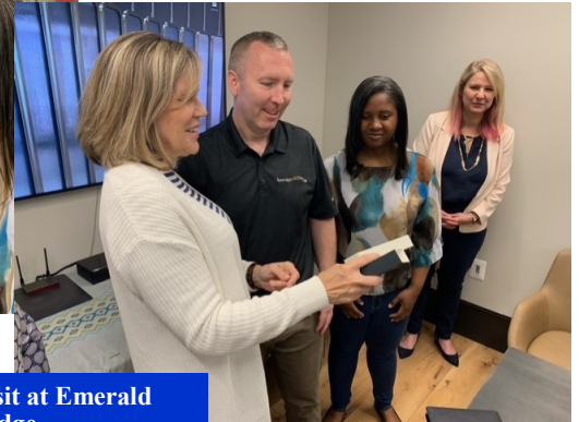
Business Appreciation Month visit at Emerald Ironworks in Woodbridge. May 2023