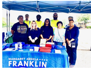
Dumpster Day, Fred Lynn Middle School May 2023