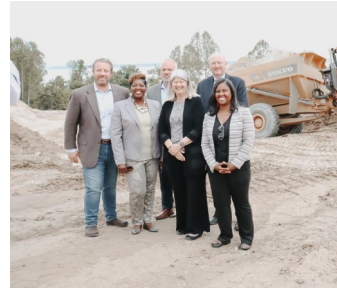
Commencement of construction on the VRE Station Garage at Potomac Shores. May 2023