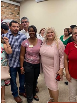
Groundbreaking ceremony of the new CASA Headquarters, Woodbridge, VA