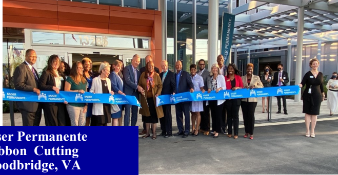
Kaiser Permanente Ribbon Cutting Woodbridge, VA