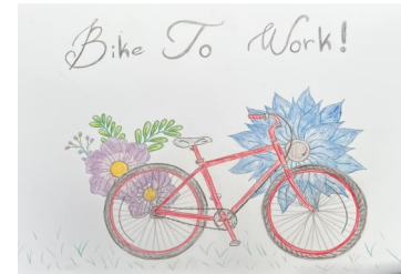
Bike to Work Day, Woodbridge VRE Station May 2023