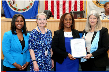
Acknowledging Child Abuse Awareness Month