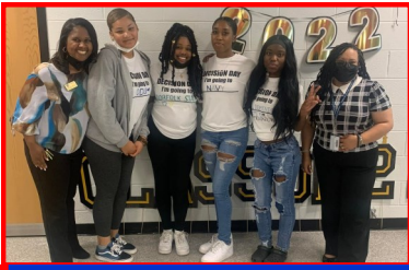
Freedom High School Decision Day