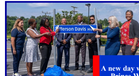
A new day with Richmond Highway: Prince William County leaders celebrate roadway name change