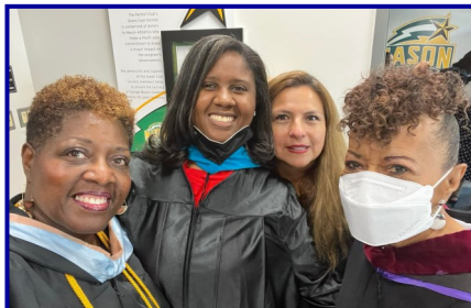
Class of 2022 Potomac High School Graduation