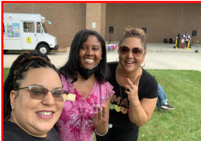
Thank you Prince William County for recognizing and celebrating LGBTQIA + Pride month