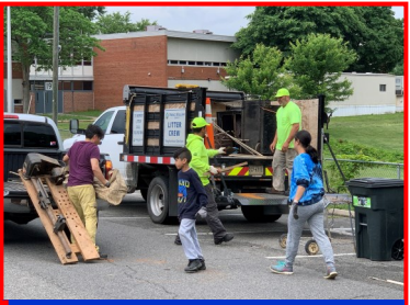
Dumpster Day at Fred Lynn Middle School