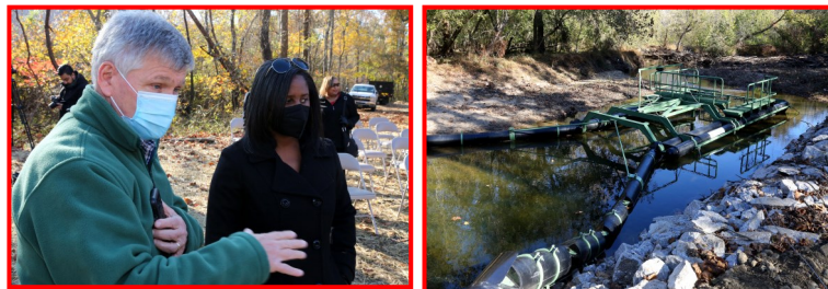
Neabsco Creek Bandalong Litter Trap Ribbon Cutting November 17, 2021