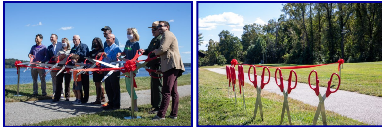
Potomac Heritage National Scenic Trail Ribbon Cutting September 26, 2021