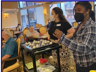
Potomac Place Assisted Living Facility meeting with residents and calling out the bingo game (even though they told me I was going too slow)! Looking forward to visiting again!