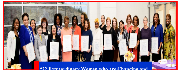
"22 Extraordinary Women who are Changing and Making an Impact in our Communities"