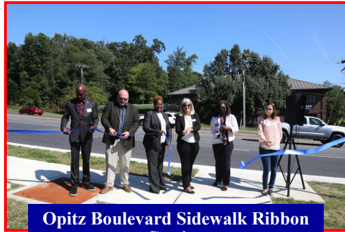
Opitz Boulevard Sidewalk Ribbon Cutting September 20, 2021